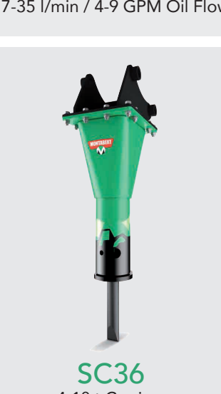
4-10 t Carriers 304 kg / 670 lb Operating Weight 55-100 l/min / 14-27 GPM Oil Flow