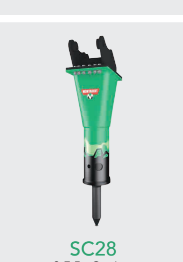
3-7,5 t Carriers 193 kg / 425 lb Operating Weight 40-75 l/min / 10-20 GPM Oil Flow