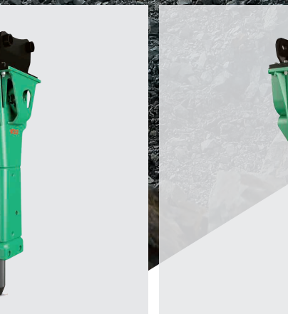
V32 18–30 t carrier weight range 1.5 t breaker 120–170 l/min oil flow range V46 27–40 t carrier weight range 2.6 t breaker 180–265 l/min oil flow range